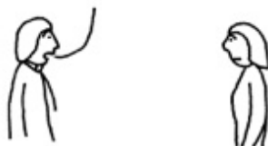
LEARNING A NEW LANGUAGE

AT THE PCC WE'LL DISCUSS THE APCM, CW VS THE BCP, THE LLM'S CRB, AND THE OLM'S BAP. OH, AND THERE ARE LETTERS FROM THE DAC, THE DDO, THE HOB AND THE ABC