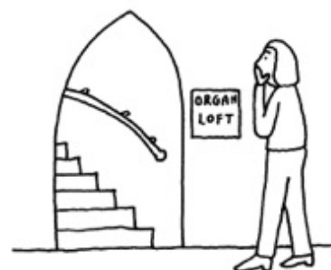
TRAVELLING TO NEW PLACES